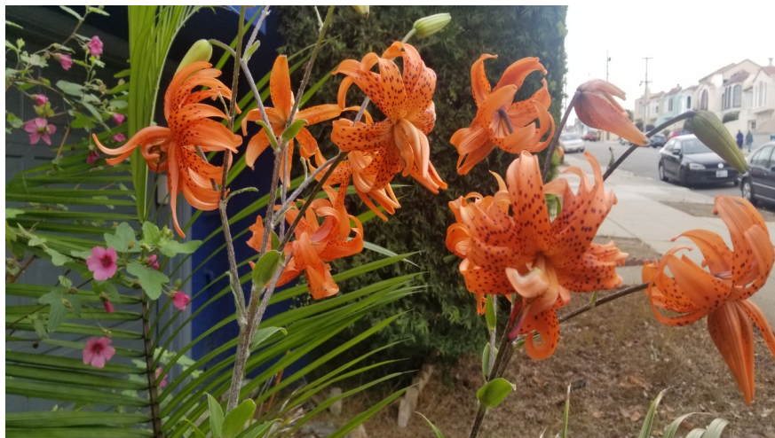
Leopard Lilies ( Iris pardalinum ) in flower in San Francisco. This is a California native.