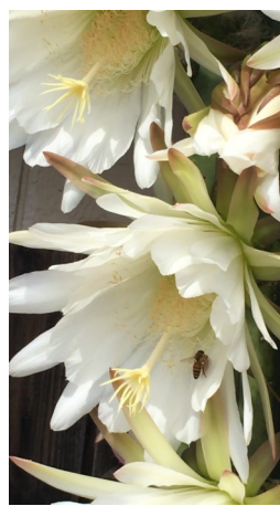
San Pedro Cactus ( Echinopsi pachanoi ) flowering in Raquel's garden. This plant is told to have 'medicinal' purposes.