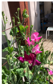
From Celia's garden, plants courtesy of Cathy V.