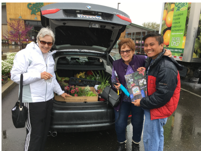
From our 2018 field trip to Green Acres in Elk Grove.

Use a water meter or soil probe to be sure you are watering as deeply as needed. Use that meter or probe again to find out if the soil dried out enough to water. And remember to keep mulch deep to retain moisture in the ground even longer.