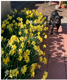
Sushi visiting Grover Beach in 2019.