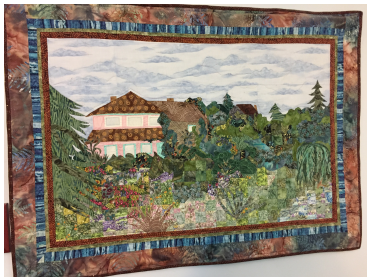
Carole not only grew gardens, she quilted them too!