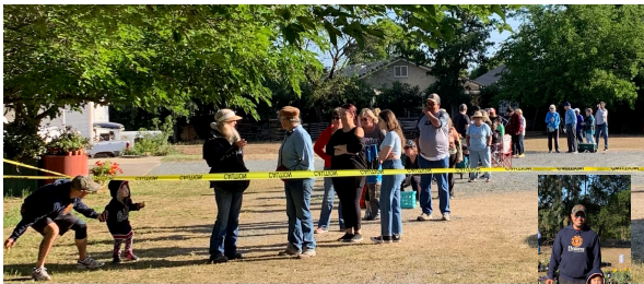
The line grew and this little one needed another cookie.