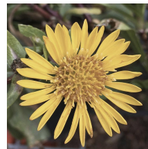
Great Valley Gumplant - Grindelia camporum

Please let me know if you'd like to attend a field trip planning meeting/lunch. We'll discuss where to go, visit with each other, and have a bite to eat.