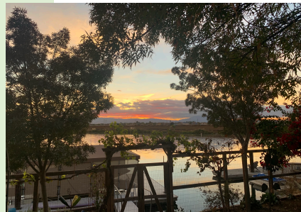
The view from Robin's garden last Fall.

If members are planning a yard sale, plants may be available to pickup and sell, with the proceeds of the plants to be donated to DIG.